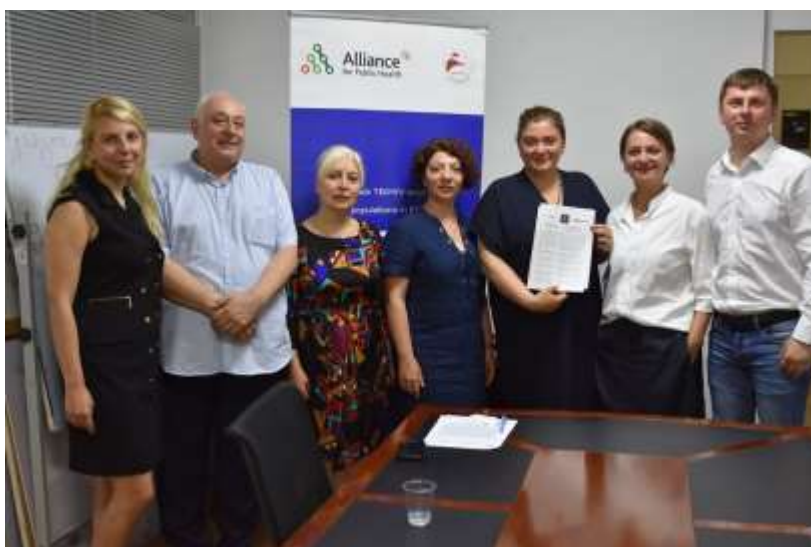
Signing of Zero TB Declaration at Tbilisi City Hall

City-level advocacy on HIV and TB: Within the frame of the Global Fund project "Fast-track TB/HIV responses for key populations in EECA cities" Tanadgoma continued leading City Task Force group consisting of representatives of state and non-governmental organizations in addition to community organizations. Due to ongoing collaboration and sensitization of the local government representatives, Tanadgoma's active advocacy efforts resulted in signature of Zero TB Declaration in 2019 by Tbilisi City Hall. As a tangible result of the project, data systems for capturing city-specific data have been established - HIV cascade and TB data at Tbilisi city level and 2017-2019 data have been collected.