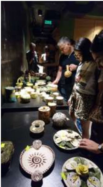
Exhibition of art therapy products

Along with the creation of promotional materials, Tanadgoma's art therapy evolved as the second line of the enterprise's production.