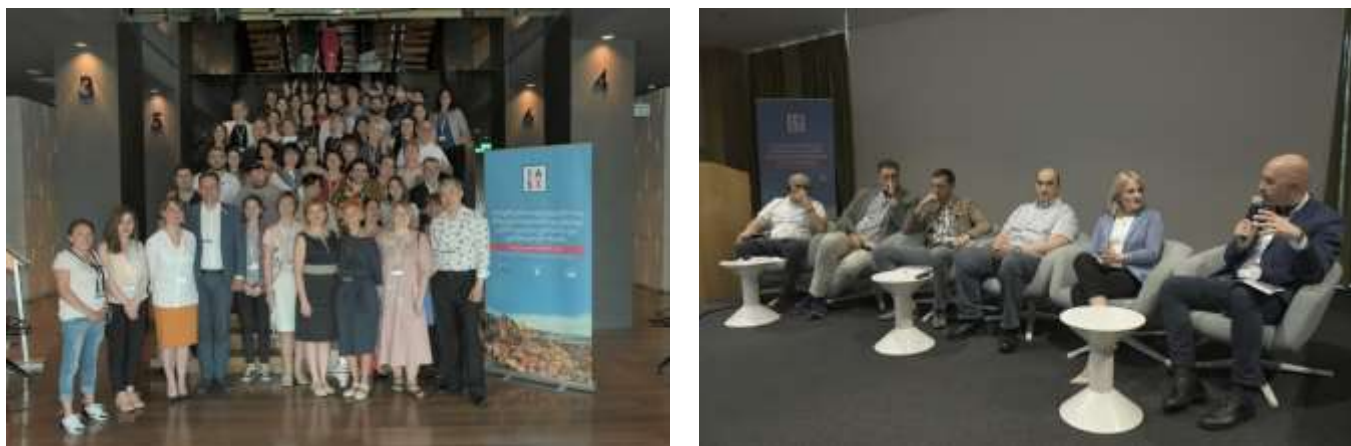
Symposium “Translating Science to End HIV in Eastern Europe and Central Asia”, June 2019, Tbilisi

Symposium “Translating Science to End HIV in Eastern Europe and Central Asia”: International AIDS Society (IAS) Educational Fund, in collaboration with Tanadgoma, organized the scientific symposium in Tbilisi. During the symposium, key scientific and policy content from the 22nd International AIDS Conference (AIDS 2018) in Amsterdam was shared and discussed, as well as implementation science priorities. More than 80 participants, including representatives from different countries attended the symposium. Specific topics included presentations and discussions on PrEP and other innovative prevention methods, integrated approaches for the prevention and treatment of HIV, tuberculosis and hepatitis, innovative ways forward for harm reduction services and strategies to reduce stigma and discrimination. Scientific research results on these specific topics were discussed for policy and programme improvements in EECA region.