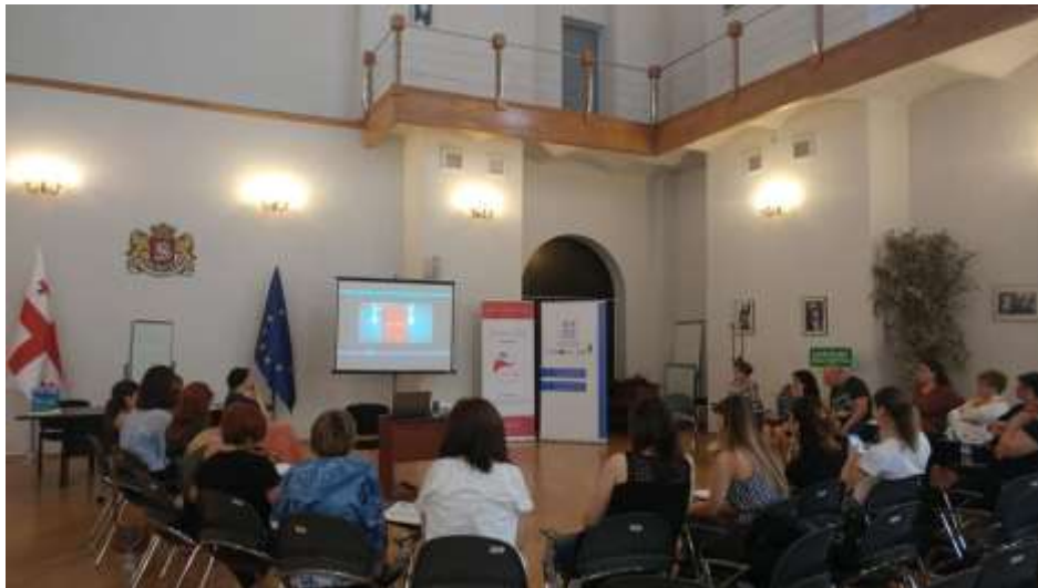
Training for coaches in MoES

In summer 2019, based on the request from the MoES, Tanadgoma, in cooperation with UNFPA, organized and conducted training of coaches on healthy lifestyle for New School Model support groups. The purpose of the trainings was to prepare coaches on incorporating Healthy Life Skills education into their work with the schools. In total 4 trainings were conducted and 78 professionals participated in the trainings.