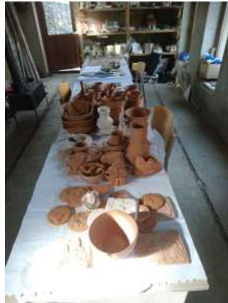
Clay workshop in Gremi

Tanadgoma's art therapy exhibition took place at hotel "Iota", on May 11, 2019, during the final meeting of the EU-funded rehabilitation project. Clay works from Tbilisi social enterprise, rehabilitation center, Geguti and Ksani prisons, were exhibited and sold. The amount accumulated was given as charity support.