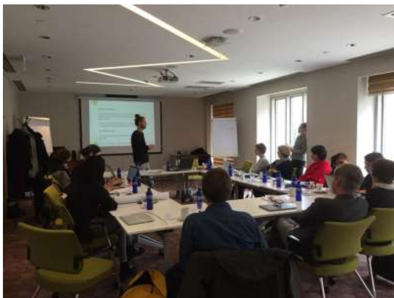
RFSU partners' workshop on CSE