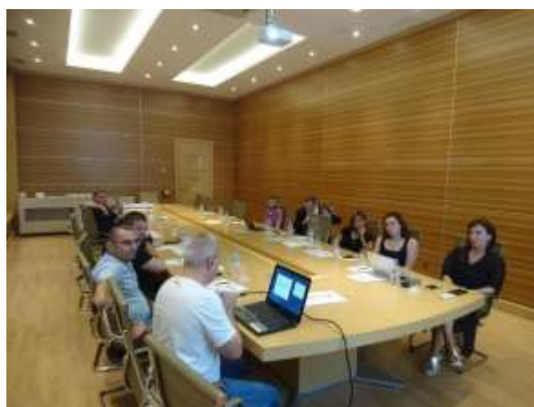
Working group meeting in Kachreti

It should be noted that by the end of 2019 Tanadgoma was able to get funding from OSF for budget advocacy of the rehabilitation of PUDs.