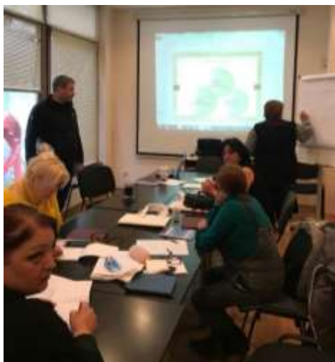
Training for vulnerable women's initiative group