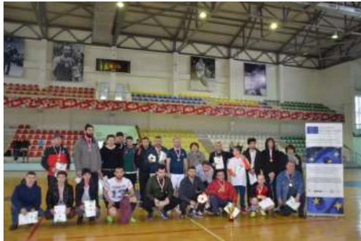
Mini-football tournament in Kutaisi