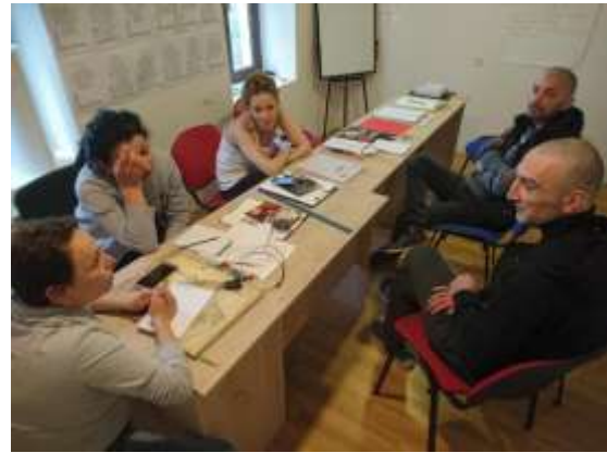
Monitoring visit of the Community Advisory Board to Gremi

Social Bureaus: Four Social Bureaus of Tanadgoma, located in four cities of Georgia (Tbilisi, Batumi, Kutaisi and Zugdidi), provided free psychosocial and medical services for rehabilitation and re-socialization of inmates, former inmates and probationers, including people who use drugs. During the reported period, Tanadgoma's social bureaus and partner organizations provided 3923 various services (medical, psychological, social and legal) to 483 beneficiaries (former prisoners, PUDs, probationers and their family members).