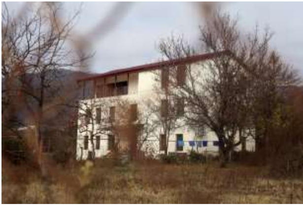
Gremi center in autumn of 2019