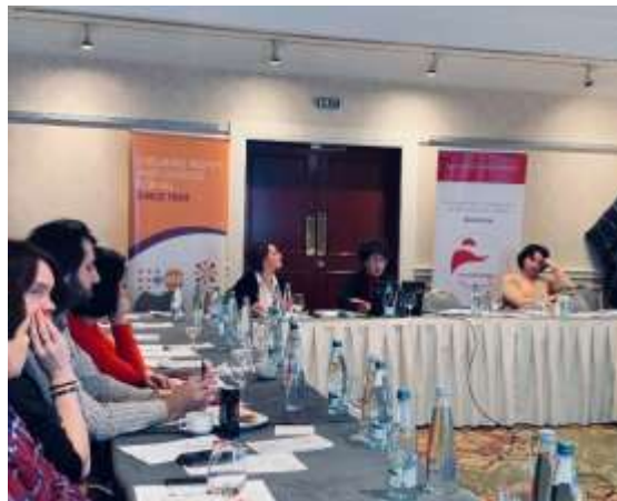
SRHR platform meetings, October and December 2019

City-level advocacy on HIV and TB: Within the frame of the Global Fund project "Fast-track TB/HIV responses for key populations in EECA cities" Tanadgoma continued leading City Task Force group consisting of representatives of state and non-governmental organizations in addition to community organizations. Due to ongoing collaboration and sensitization of the local government representatives, Tanadgoma's active advocacy efforts resulted in signature of Zero TB Declaration in 2019 by Tbilisi City Hall. As a tangible result of the project, data systems for capturing city-specific data have been established - HIV cascade and TB data at Tbilisi city level and 2017-2019 data have been collected.