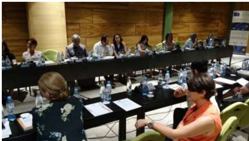
Closure of EU-funded rehabilitation project

Besides, during 2019, 7 meetings took place with representatives of social services of Special Penitentiary Department to share information and coordinate services among NGOs and the Ministry.