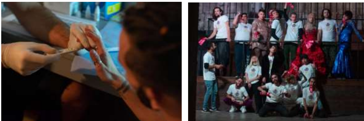
World AIDS Day 2019

World AIDS Day event: AIDS Healthcare Foundation supported Tanadgoma's initiative to conduct World AIDS Day-related event in cooperation with a night club Khidi. Collaboration with Khidi has some history, as Tanadgoma has been organizing HIV prevention queer-friendly events with them for about two years already. AHF provided some financial support, HIV tests, condoms and lubricants. The event was attended by more than 1000 beneficiaries.