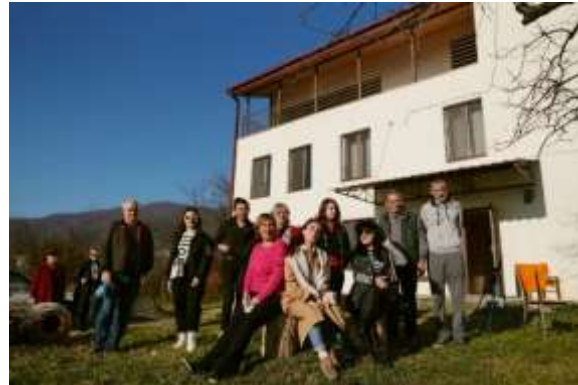
Media tour in Gremi