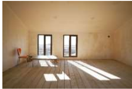
Third floor – area for the sport activities – still to be finished