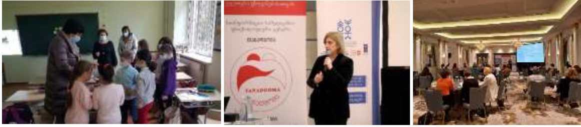
Doctor's hour monitoring at school/Concluding conference