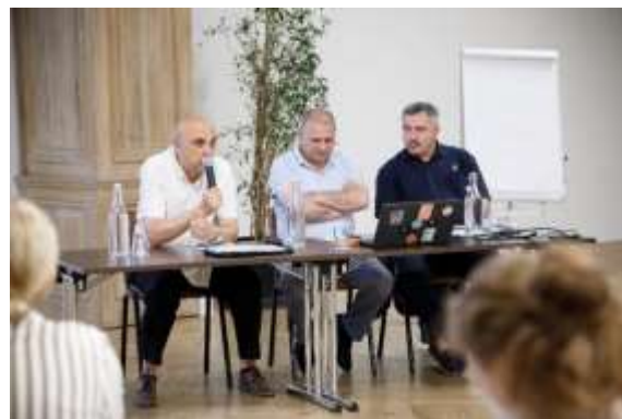
Medical abortion study results dissemination meeting