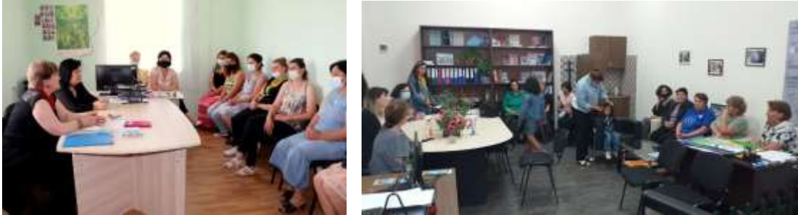
Meetings in Akhaltsikhe and Ninotsminda municipalities

In order to provide supportive educational materials on SRHR for ethnic minorities, Tanadgoma managed to adapt 6 videos spots – 4 videos and 2 animations, prepared during the previous years. The texts of the videos were translated into Azeri and Armenian languages, subtitles were added for hearing-impaired audience, and they were shared with the ethnic minority communities.