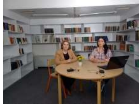
Filming videoblogs for Facebook page “Tanadgoma Mshoblebs”