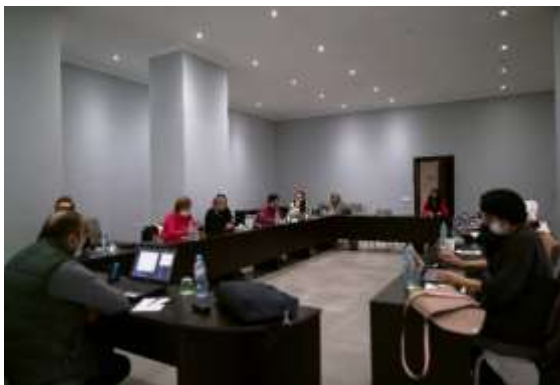
Training for media representatives

Publish articles in the print or social media about the rehabilitation, create videos and publish through social media about rehabilitation. Articles on rehabilitation were published in social media by journalists that took part in the media tour. Tanadgoma created four video spots and published them on Facebook page of the Gremi rehab center. Three publications were published through social media ( http://tpress.ge/2021/12/13/ ; https://netgazeti.ge/life/580737/ ; https://socreactiveblog.wordpress.com/2021/09/25/ ). The latter publication, titled “To the light” was awarded the third prize at the international competition organized by Eurasian Harm Reduction Association (EHRA).