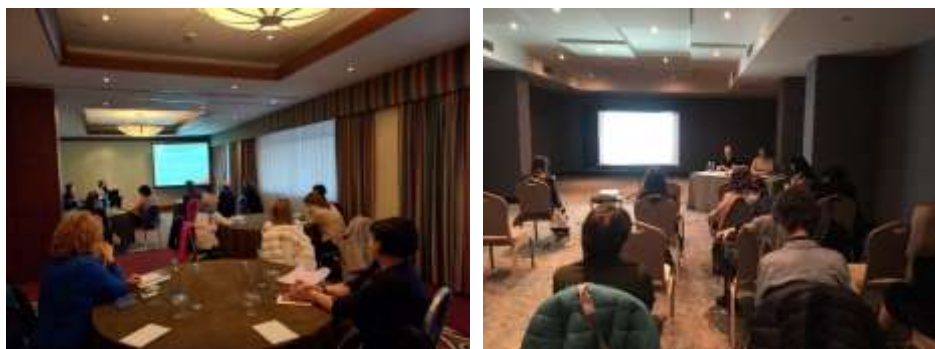
Workshops to present researches on SRHR needs of women survivors of oncological diseases and SRHR needs of mental health patients

Based on the research findings and recommendations, as well as on the discussions held at the meeting, experts of “Tanadgoma” elaborated two types of leaflets: one for mental health medical staff and social workers and another - for patients and their caregivers on the issues of reproductive health problems among mental health patients, and possible ways of dealing with them. The leaflets will be provided to relevant specialists and distributed further to their patients.