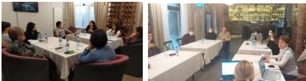
Final meeting for selecting the municipality with the best SRHR promotion campaign/ Elaboration of communication plan of 2022-2024 under „Mother and Newborn Health Strategy“

In cooperation with NCDC, organizing working meetings with allies in order to elaborate communication plan and creating main messages for public for 2022-2024 (recruiting PR/communication expert for consultancy). As in 2019, during the reporting year Tanadgoma assisted NCDC in developing communication plan under „Mother and Newborn Health Strategy“ for years 2022-2024. Tanadgoma selected an expert through an open competition and conducted 2 meetings with representatives of NCDC. Purpose of these meetings was to plan working group activities, agree on the structure of the document and prepare the first draft. On November, 11-12 Tanadgoma carried out 2-days meeting in Kakheti region with participation of nongovernmental organizations, working in the field of reproductive health, youth, community organizations, members of municipalities, inhabited with ethnic minorities and representatives of NCDC. The purpose of the meeting was to introduce the draft communication plan document, to get feedback from participants and develop main communication messages. At the end of meeting final version of document was elaborated and handed over to NCDC for further revision and approval.