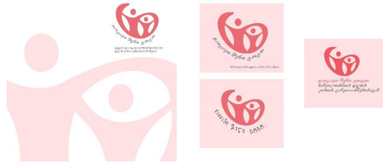
Winner logo for HPV vaccination promotion campaign