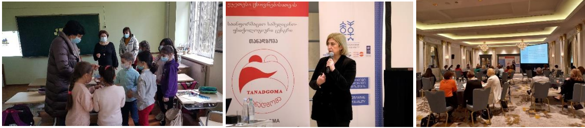
Doctor's hour monitoring at school/Concluding conference