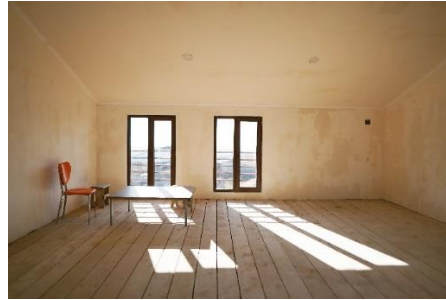
Third floor – area for the sport activities – still to be finished