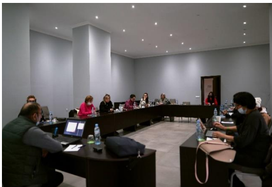
Training for media representatives

Publish articles in the print or social media about the rehabilitation, create videos and publish through social media about rehabilitation. Articles on rehabilitation were published in social media by journalists that took part in the media tour. Tanadgoma created four video spots and published them on Facebook page of the Gremi rehab center. Three publications were published through social media ( http://tpress.ge/2021/12/13/ ; https://netgazeti.ge/life/580737/ ; https://socreactiveblog.wordpress.com/2021/09/25/ ). The latter publication, titled “To the light” was awarded the third prize at the international competition organized by Eurasian Harm Reduction Association (EHRA).