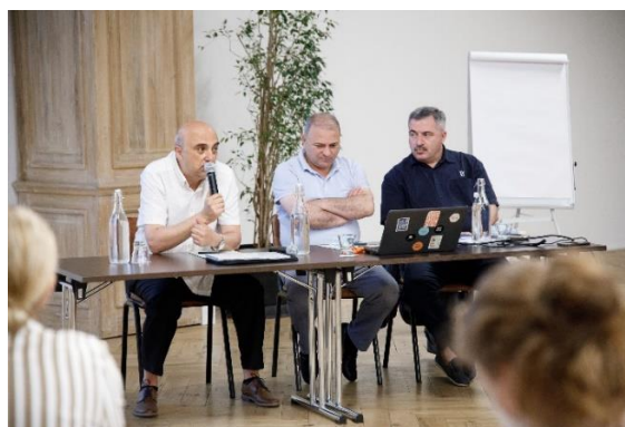
Medical abortion study results dissemination meeting