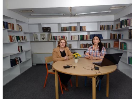
Filming videoblogs for Facebook page “Tanadgoma Mshobles”