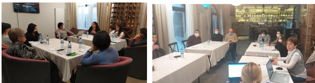
Final meeting for selecting the municipality with the best SRHR promotion campaign/ Elaboration of communication plan of 2022-2024 under „Mother and Newborn Health Strategy“

In cooperation with NCDC, organizing working meetings with allies in order to elaborate communication plan and creating main messages for public for 2022-2024 (recruiting PR/communication expert for consultancy). As in 2019, during the reporting year Tanadgoma assisted NCDC in developing communication plan under „Mother and Newborn Health Strategy“ for years 2022-2024. Tanadgoma selected an expert through an open competition and conducted 2 meetings with representatives of NCDC. Purpose of these meetings was to plan working group activities, agree on the structure of the document and prepare the first draft. On November, 11-12 Tanadgoma carried out 2-days meeting in Kakheti region with participation of nongovernmental organizations, working in the field of reproductive health, youth, community organizations, members of municipalities, inhabited with ethnic minorities and representatives of NCDC. The purpose of the meeting was to introduce the draft communication plan document, to get feedback from participants and develop main communication messages. At the end of meeting final version of document was elaborated and handed over to NCDC for further revision and approval.