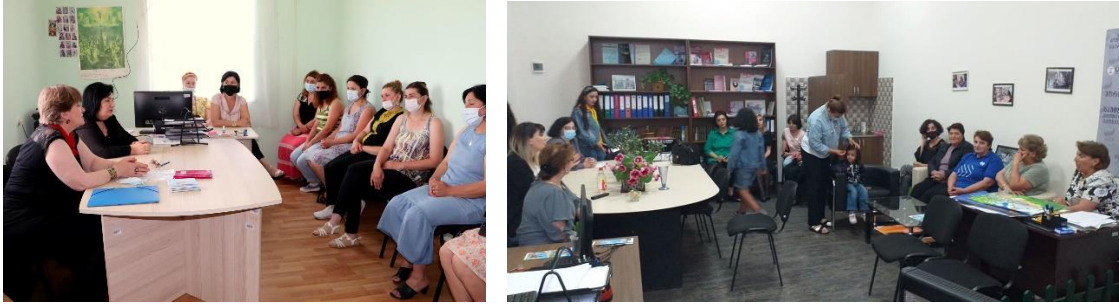
Meetings in Akhaltsikhe and Ninotsminda municipalities

In order to provide supportive educational materials on SRHR for ethnic minorities, Tanadgoma managed to adapt 6 videos spots – 4 videos and 2 animations, prepared during the previous years. The texts of the videos were translated into Azeri and Armenian languages, subtitles were added for hearing-impaired audience, and they were shared with the ethnic minority communities.