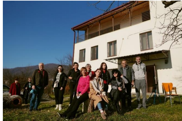
Media tour in Gremi