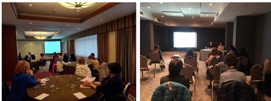
Workshops to present researches on SRHR needs of women survivors of oncological diseases and SRHR needs of mental health patients

Based on the research findings and recommendations, as well as on the discussions held at the meeting, experts of “Tanadgoma” elaborated two types of leaflets: one for mental health medical staff and social workers and another - for patients and their caregivers on the issues of reproductive health problems among mental health patients, and possible ways of dealing with them. The leaflets will be provided to relevant specialists and distributed further to their patients.