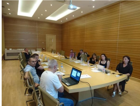
Working group meeting in Kachreti

It should be noted that by the end of 2019 Tanadgoma was able to get funding from OSF for budget advocacy of the rehabilitation of PUDs.