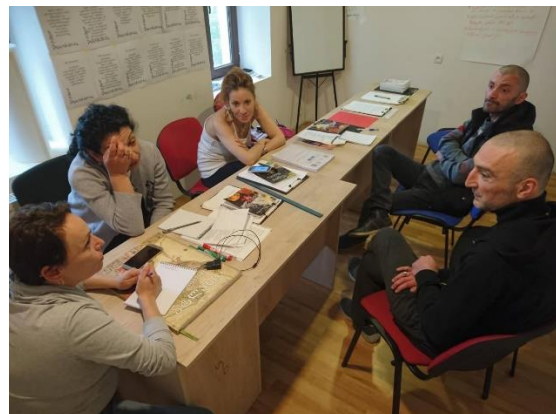
Monitoring visit of the Community Advisory Board to Gremi

Social Bureaus: Four Social Bureaus of Tanadgoma, located in four cities of Georgia (Tbilisi, Batumi, Kutaisi and Zugdidi), provided free psychosocial and medical services for rehabilitation and re-socialization