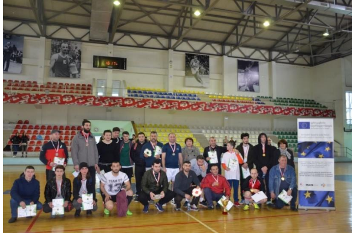
Mini-football tournament in Kutaisi