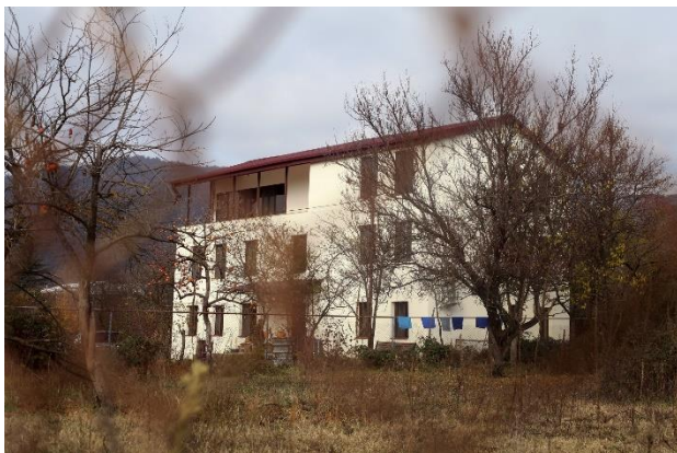
Gremi center in autumn of 2019

During the reported period, within the project “Bridging the Gaps”, a Community Advisory Board was established consisting of 5 community members – 3 females and 2 males. Community members conducted monitoring visits to rehabilitation center and provided number of recommendations for improved functioning and tailoring center’s activities more to the beneficiaries’ needs.