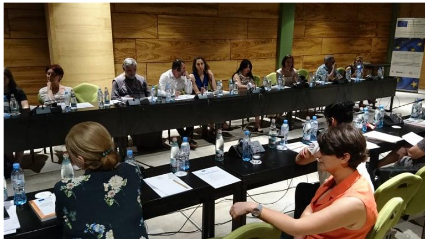
Closure of EU-funded rehabilitation project

Besides, during 2019, 7 meetings took place with representatives of social services of Special Penitentiary Department to share information and coordinate services among NGOs and the Ministry.