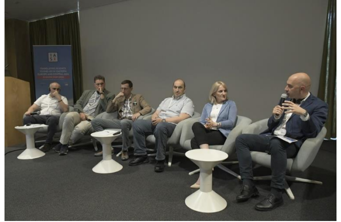
Symposium “Translating Science to End HIV in Eastern Europe and Central Asia”, June 2019, Tbilisi