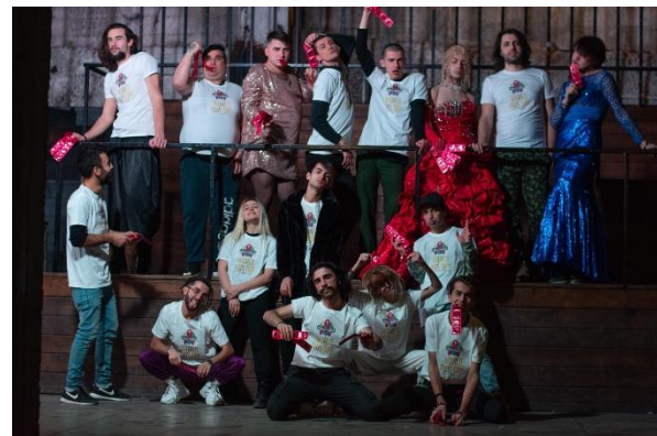
World AIDS Day 2019

Symposium “Translating Science to End HIV in Eastern Europe and Central Asia”: International AIDS Society (IAS) Educational Fund, in collaboration with Tanadgoma, organized the scientific symposium in Tbilisi. During the symposium, key scientific and policy content from the 22nd International AIDS Conference (AIDS 2018) in Amsterdam was shared and discussed, as well as implementation science priorities. More than 80 participants, including representatives from different countries attended the symposium. Specific topics included presentations and discussions on PrEP and other innovative prevention methods, integrated approaches for the prevention and treatment of HIV, tuberculosis and hepatitis, innovative ways forward for harm reduction services and strategies to reduce stigma and discrimination. Scientific research results on these specific topics were discussed for policy and programme improvements in EECA region.