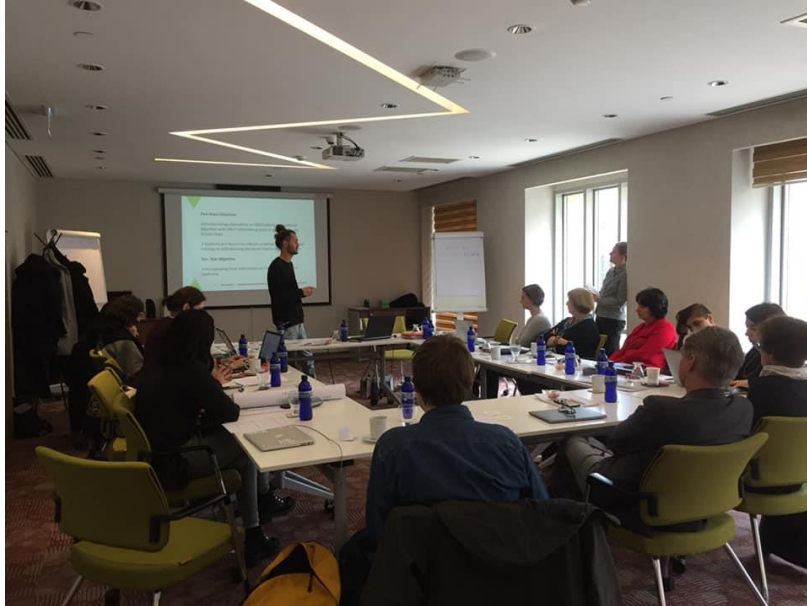
RFSU partners' workshop on CSE