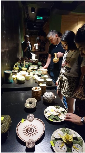
Exhibition of art therapy products

Along with the creation of promotional materials, Tanadgoma’s art therapy evolved as the second line of the enterprise’s production.