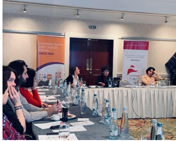
SRHR platform meetings, October and December 2019

City-level advocacy on HIV and TB: Within the frame of the Global Fund project "Fast-track TB/HIV responses for key populations in EECA cities" Tanadgoma continued leading City Task Force group consisting of representatives of state and non-governmental organizations in addition to community organizations. Due to ongoing collaboration and sensitization of the local government representatives, Tanadgoma's active advocacy efforts resulted in signature of Zero TB Declaration in 2019 by Tbilisi City Hall. As a tangible result of the project, data systems for capturing city -specific data have been established - HIV cascade and TB data at Tbilisi city level and 2017-2019 data have been collected.