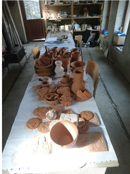
Clay workshop in Gremi

Tanadgoma’s art therapy exhibition took place at hotel “Iota”, on May 11, 2019, during the final meeting of the EU-funded rehabilitation project. Clay works from Tbilisi social enterprise, rehabilitation center, Geguti and Ksani prisons, were exhibited and sold. The amount accumulated was given as charity support.