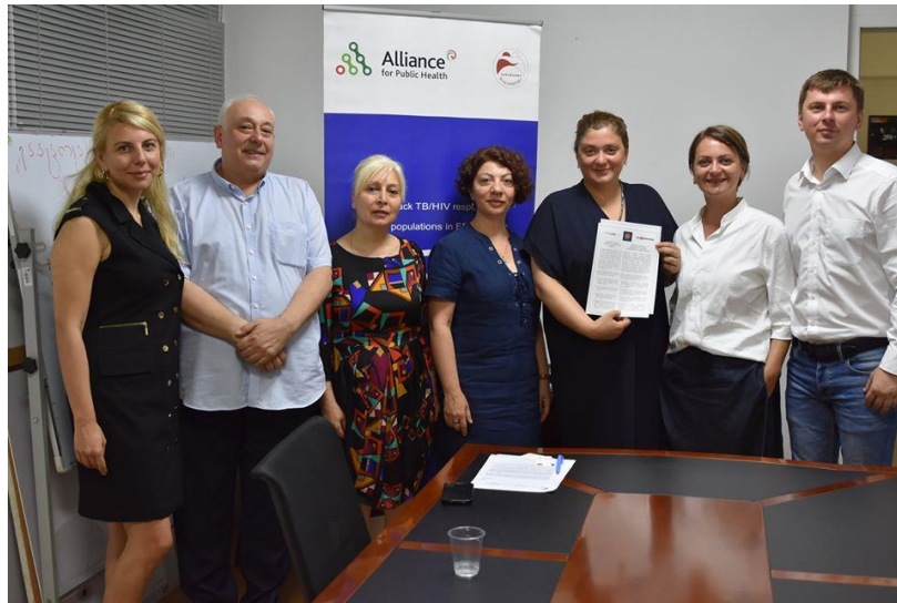
Signing of Zero TB Declaration at Tbilisi City Hall

City-level advocacy on HIV and TB: Within the frame of the Global Fund project "Fast-track TB/HIV responses for key populations in EECA cities" Tanadgoma continued leading City Task Force group consisting of representatives of state and non-governmental organizations in addition to community organizations. Due to ongoing collaboration and sensitization of the local government representatives, Tanadgoma's active advocacy efforts resulted in signature of Zero TB Declaration in 2019 by Tbilisi City Hall. As a tangible result of the project, data systems for capturing city -specific data have been established - HIV cascade and TB data at Tbilisi city level and 2017-2019 data have been collected.