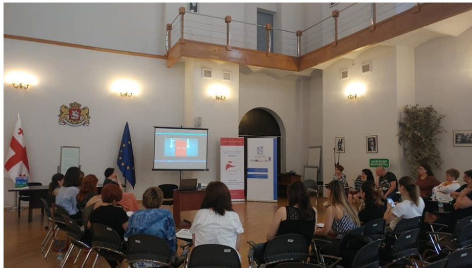
Training for coaches in MoES

In summer 2019, based on the request from the MoES, Tanadgoma, in cooperation with UNFPA, organized and conducted training of coaches on healthy lifestyle for New School Model support groups. The purpose of the trainings was to prepare coaches on incorporating Healthy Life Skills education into their work with the schools. In total 4 trainings were conducted and 78 professionals participated in the trainings.