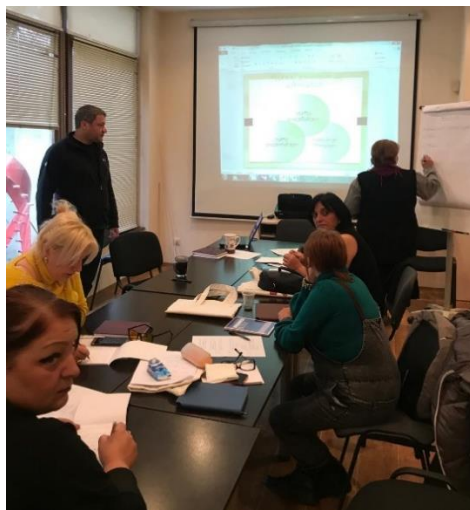
Training for vulnerable women's initiative group

Trainings for victims of violence: During 2019, within the OSF funded initiative, 2 training modules were developed for vulnerable women-victims of gender based violence: "Advocacy and community mobilization" and "Human rights and violence". These trainings were conducted with participation of 15 community activists – victims of GBV. This project is continuation of EU-funded action where vulnerable women's initiative group was established. Therefore, OSF funded initiative played important role in sustainability and capacity development of women's initiative group created earlier in another project.