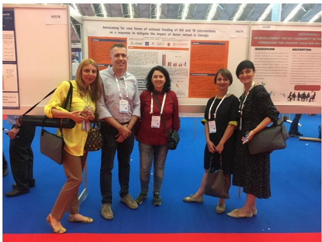
Our team with partners at Tanadgoma posted, AIDS 2018

Tanadgoma staff used several opportunities to increase and strengthen its skills and abilities through participation in internal, as well as external training. Some staff took part in the regional and international events and conferences, such as International AIDS conference in Amsterdam, City Health conference in Odessa, study visit to Amsterdam for exchanging and sharing experiences and best practices of successful models of municipality and NGO partnership.