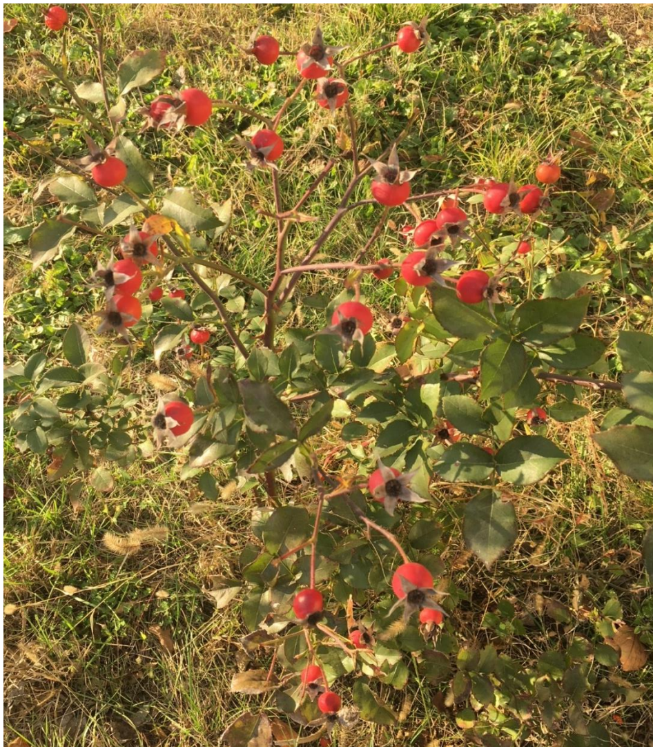
Dog-rose at Gremi rehabilitation center