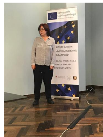
GYLA lawyer speaking about legal assistance in the cases of violence during the presentation of the research results

Another EU-supported project, implemented by Georgian Young Lawyers Association in partnership with Tanadgoma, included provision of psychological and legal support to victims of gender-based violence in five cities of Georgia, based on the location of Tanadgoma offices.