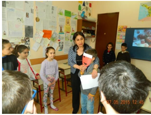
Piloting lesson in one of the Tbilisi schools

In October, within their visit to Georgia, Tanadgoma was visited by large delegation of RFSU board and members. This was one more step in expanding partnership, and also served Tanadgoma in its advocacy efforts targeting Ministry of Education.