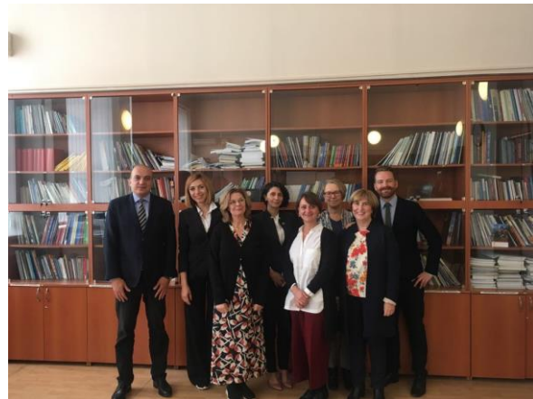
RFSU and Tanadgoma representatives at the Ministry of Education