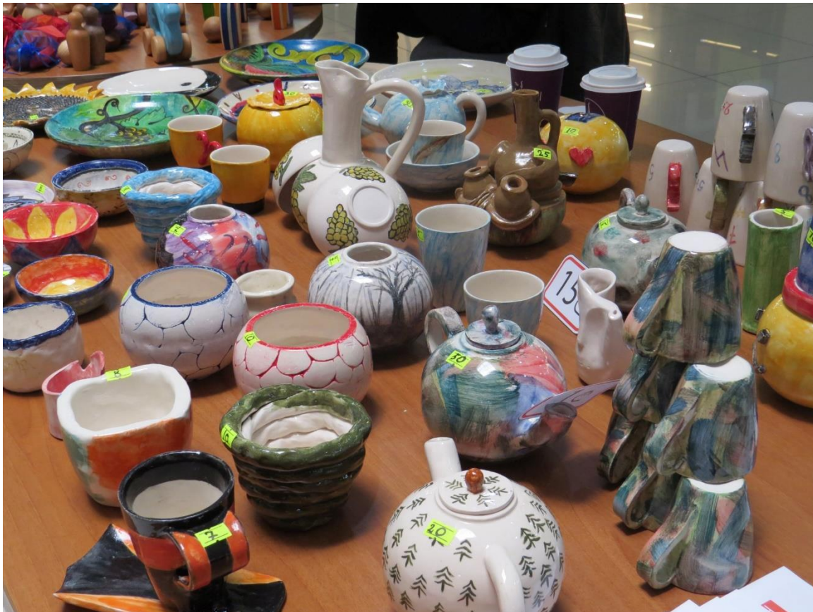
Products of art therapy exhibited at the Social Enterprises' fair

In 2018 Tanadgoma took part in 2 exhibitions of Social Enterprises, presenting both enterprise products and art therapy products.