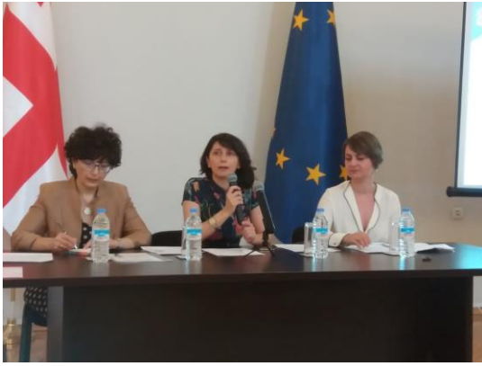
Presenting recommendations of the pilot project