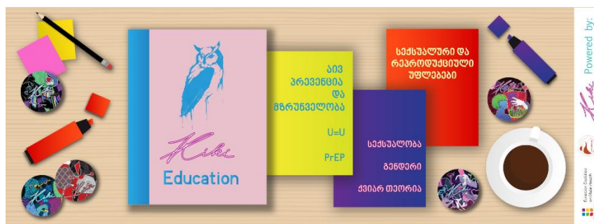
Cover of the Kiki Education online platform

With financial support of ECOM, Tanadgoma started capacity development of trans people and HIV-positive gay and other MSM, in order to involve them in advocating for their right to health through training on local and international advocacy mechanisms and tools. During the reported period, 2 capacity building training were conducted with participation of 25 Trans and MSM. Also, Sunday schools for MSM and trans people started in 2018, as a part of learning platform “Kiki Education”. The platform includes lectures at the Sunday school, trainings and Living Library events. Two Sunday school lectures/meetings were organized with participation of 35 representatives of MSM/Trans communities.