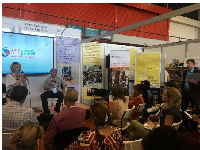
Representative of the Penitentiary Department with support of Tanadgoma giving a speech at AIDS 2018