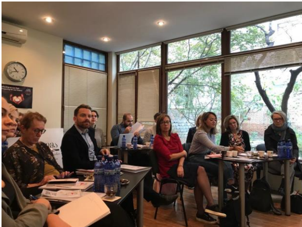
RFSU board visiting Tanadgoma

In October, within their visit to Georgia, Tanadgoma was visited by large delegation of RFSU board and members. This was one more step in expanding partnership, and also served Tanadgoma in its advocacy efforts targeting Ministry of Education.