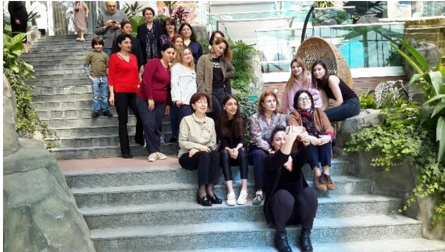
Experts' group meeting for elaboration of the communication strategy

Tanadgoma continued to cooperate with state structures in 2018, specifically in planning the SRH strategies and programs on national level. After approval of “National Strategy of Mother and Newborn Health for 2017-2030” and its action plan by Georgian government, Tanadgoma started providing technical assistance to NCDCPH in planning and implementation of the communication strategy of the action plan. During 2018, Tanadgoma organized two outdoor sessions to develop the communication strategy, with participation of NCDCPH staff, relevant experts and representatives of NGOs. As a result, the communication strategy was developed and finalized. It was handed out to NCDCPH and is due to approve in spring of 2019.