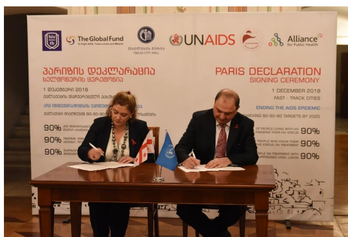
Vice Mayor of Tbilisi and UNAIDS Regional Office representatives signing the Paris Declaration

One success of Tanadgoma in 2018 was a result of 2-years advocacy work to decentralize HIV services and to increase municipalities' role in financing and providing HIV services for population. On December 1, Tbilisi joined the Paris Declaration to end the AIDS epidemic by 2030. The event was attended by City hall officials, representatives of UNAIDS, UNFPA, the Heads and Representatives of National Center for Disease Control and Public Health, Infectious Diseases, AIDS and Clinical Immunology Center and civil society. Tbilisi joined the cities declaring their commitment to address the AIDS epidemics and disparities in access to basic health and social services, social justice and economic opportunities.