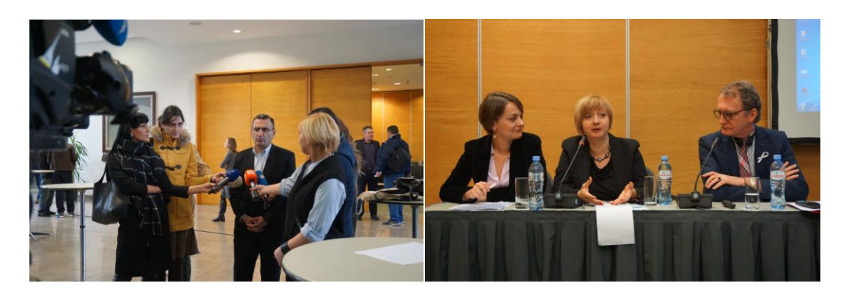
Advocacy for Sexual and Reproductive Health and Rights both in Georgia and on the international level.

As part of the advocacy agenda for increased funding (including state funding) of HIV prevention, Tanadgoma took active part in development of both National Strategic Plan on HIV/AIDS for 2016-2018 and GF Concept Note for 2016-2018 under the New Funding Model. Also, under EU-funded project, Tanadgoma prepared and presented prevention packages for sex workers and MSM for further institutionalization. Discussions on mechanisms for state funding for NGOs started and will continue during 2016, as a part of GF transition plan. Another progress under this objective is that 3 policy dialogue meetings were held with Batumi, Kutaisi city hall and regional administration's representatives to advocate for municipal funding of reproductive health services for FSWs. Advocacy for municipal funding is also included in the regional proposal to be submitted to the Global Fund in 2016, whereas Tanadgoma is one of the partners. Also, Tanadgoma has united in a SRHR platform together with other RFSU partner organizations from Georgia and took part in advocacy of SRHR issues during UPR of Georgia.