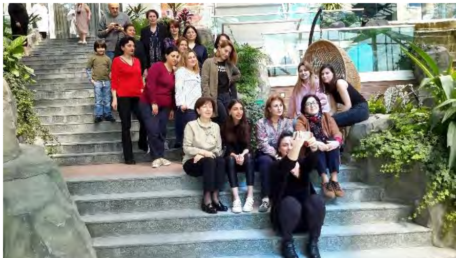
Experts' group meeting for elaboration of the communication strategy

Tanadgoma continued to cooperate with state structures in 2018, specifically in planning the SRH strategies and programs on national level. After approval of “National Strategy of Mother and Newborn Health for 2017-2030” and its action plan by Georgian government, Tanadgoma started providing technical assistance to NCDCPH in planning and implementation of the communication strategy of the action plan. During 2018, Tanadgoma organized two outdoor sessions to develop the communication strategy, with participation of NCDCPH staff, relevant experts and representatives of NGOs. As a result, the communication strategy was developed and finalized. It was handed out to NCDCPH and is due to approve in spring of 2019.