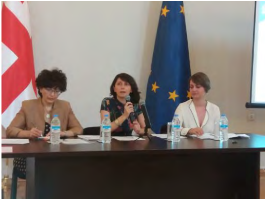
Presenting recommendations of the pilot project