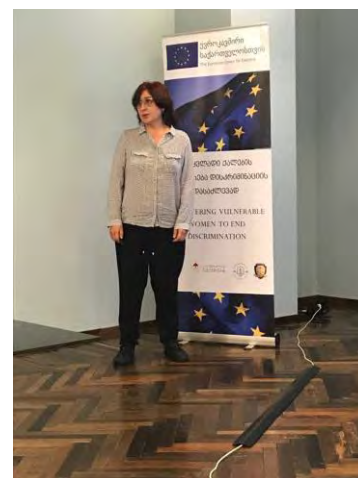
GYLA lawyer speaking about legal assistance in the cases of violence during the presentation of the research results

Another EU-supported project, implemented by Georgian Young Lawyers Association in partnership with Tanadgoma, included provision of psychological and legal support to victims of gender-based violence in five cities of Georgia, based on the location of Tanadgoma offices.