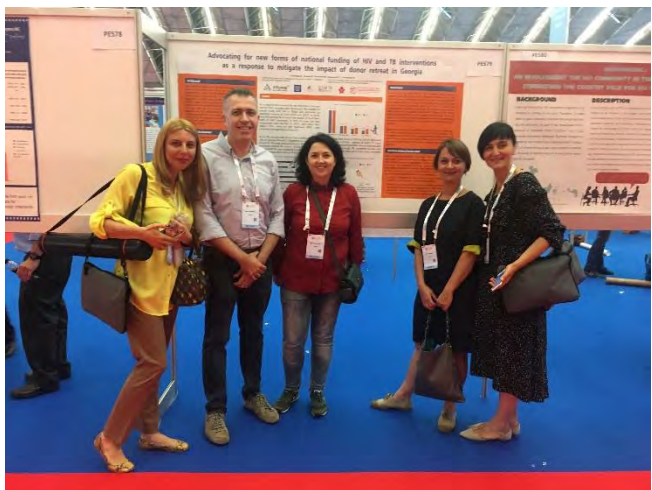
Our team with partners at Tanadgoma posted, AIDS 2018

Tanadgoma staff used several opportunities to increase and strengthen its skills and abilities through participation in internal, as well as external training. Some staff took part in the regional and international events and conferences, such as International AIDS conference in Amsterdam, City Health conference in Odessa, study visit to Amsterdam for exchanging and sharing experiences and best practices of successful models of municipality and NGO partnership.