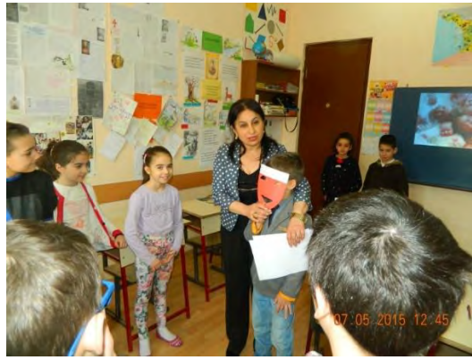
Piloting lesson in one of the Tbilisi schools

In October, within their visit to Georgia, Tanadgoma was visited by large delegation of RFSU board and members. This was one more step in expanding partnership, and also served Tanadgoma in its advocacy efforts targeting Ministry of Education.