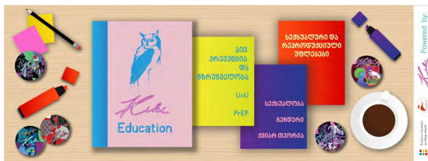
Cover of the Kiki Education online platform

With financial support of ECOM, Tanadgoma started capacity development of trans people and HIV-positive gay and other MSM, in order to involve them in advocating for their right to health through training on local and international advocacy mechanisms and tools. During the reported period, 2 capacity building training were conducted with participation of 25 Trans and MSM. Also, Sunday schools for MSM and trans people started in 2018, as a part of learning platform “Kiki Education”. The platform includes lectures at the Sunday school, trainings and Living Library events. Two Sunday school lectures/meetings were organized with participation of 35 representatives of MSM/Trans communities.