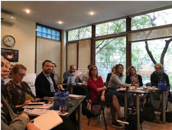
RFSU board visiting Tanadgoma

In October, within their visit to Georgia, Tanadgoma was visited by large delegation of RFSU board and members. This was one more step in expanding partnership, and also served Tanadgoma in its advocacy efforts targeting Ministry of Education.