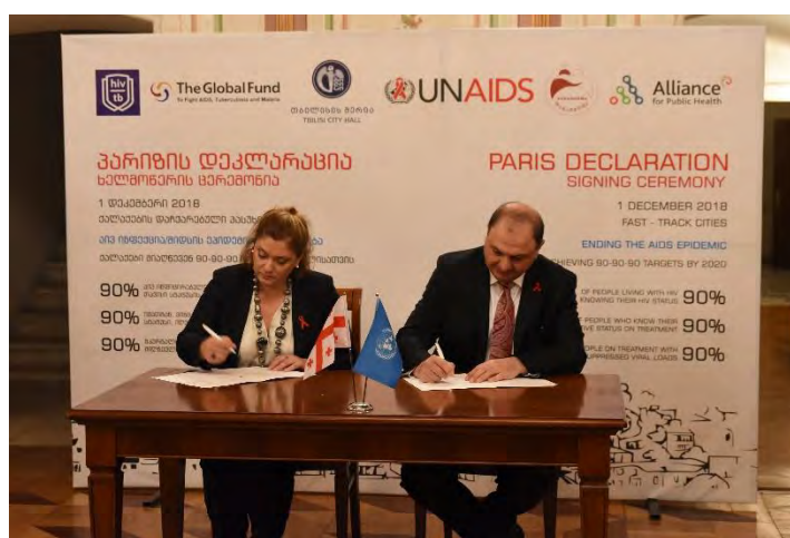
Vice Mayor of Tbilisi and UNAIDS Regional Office representatives signing the Paris Declaration

One success of Tanadgoma in 2018 was a result of 2-years advocacy work to decentralize HIV services and to increase municipalities' role in financing and providing HIV services for population. On December 1, Tbilisi joined the Paris Declaration to end the AIDS epidemic by 2030. The event was attended by City hall officials, representatives of UNAIDS, UNFPA, the Heads and Representatives of National Center for Disease Control and Public Health, Infectious Diseases, AIDS and Clinical Immunology Center and civil society. Tbilisi joined the cities declaring their commitment to address the AIDS epidemics and disparities in access to basic health and social services, social justice and economic opportunities.