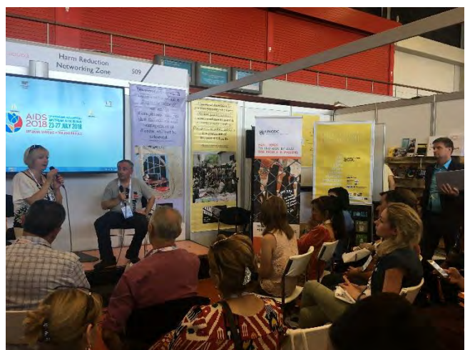
Representative of the Penitentiary Department with support of Tanadgoma giving a speech at AIDS 2018